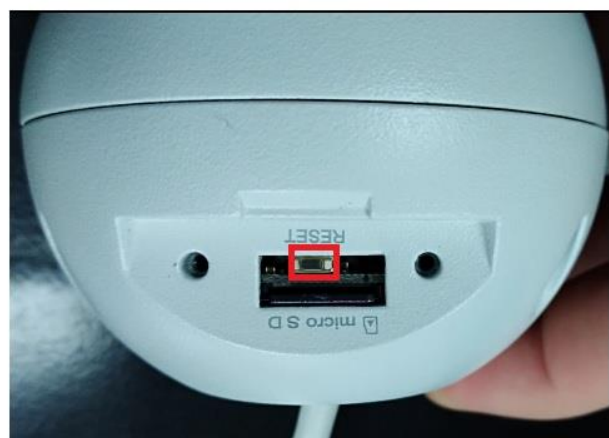
Image above shows how to access reset button on cameras with turret housing