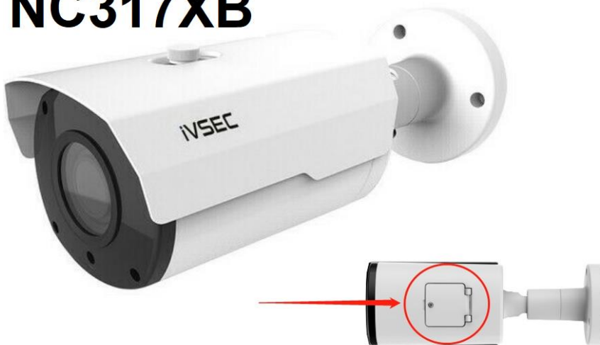
Image above shows how to access NC317XB reset button